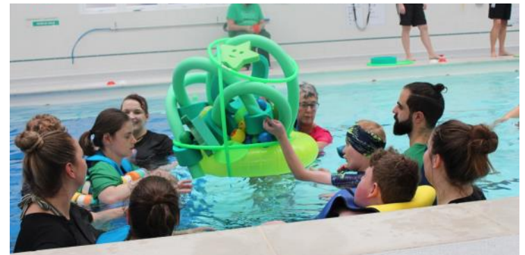
The Swim Team welcomed students from Angmering School for a Christmas pool party.